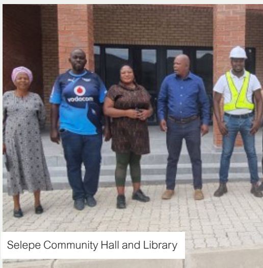
Selepe Community Hall and Library